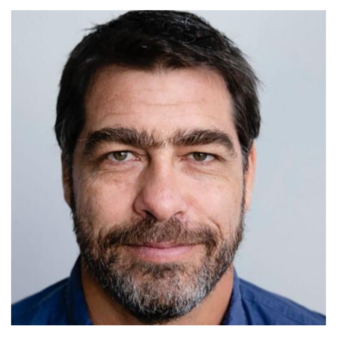
BIOAQUAREEF Ocean Harvest announced some days ago the